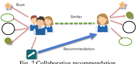
Fig. 2 Collaborative recommendation

b. Collaborative recommendations: In hereCollaborative filtering user will be recommended on likes and desires of other users in order to compute a similarity index between users and recommend items to them accordingly it uses their opinion to recommend items to the active user